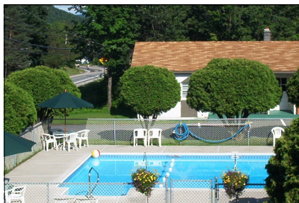
Take a dip in our refreshing pool!